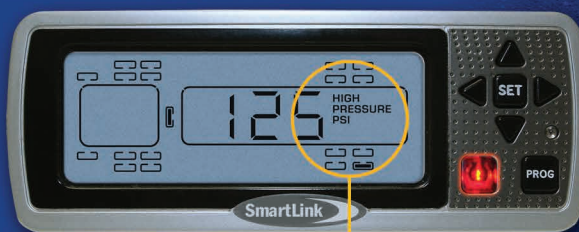
High Pressure Warning