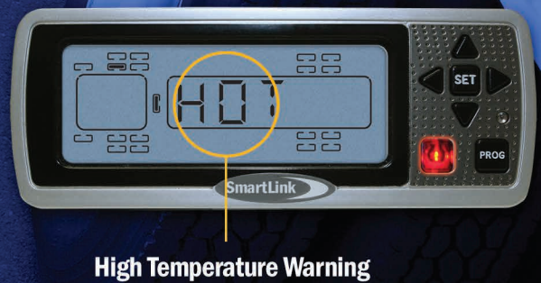
High Temperature Warning