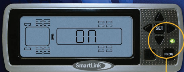
Green Means Good™